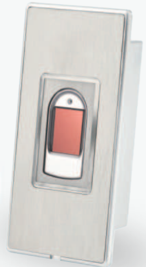
Touchkey Fingerprint Reader R7-SS

A beautiful home begins with a grand entrance and a grand entrance deserves nothing less than the exquisite and discreet TOUCHKEY Finger print reader. Say goodbye to all the bulky and obtrusive fingerprint locks. The sensor uses an ID3 algorithm for biometric data processing, which is certified in the USA by the NIST National Institute and is MINEX 3 certified. Due to the high quality our readers enable safe and easy to use.