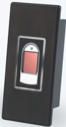
Touchkey Fingerprint Reader R7-BL